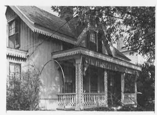
Boykin House, Smithfield

HICKORY NECK CHURCH, JAMES CITY COUNTY: This tiny brick building, the remaining portion of the Lower Church of colonial Blisland Parish, was reconcecrated in 1907 following prolonged service as an Academy.