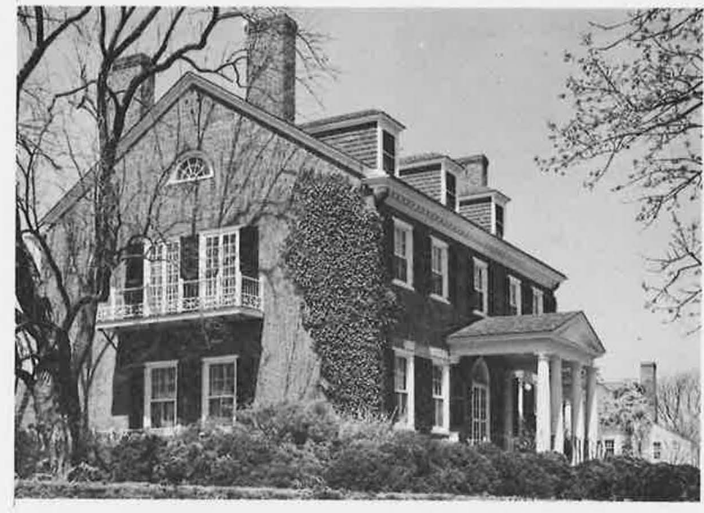
MORVEN, ALBEMARLE COUNTY: The sophisticated early-19th century house, magnificent location and grounds, combine to make Morven one of Piedmont Virginia's more memorable estates.

DANVILLE HISTORIC DISTRICT: Few Southern communities can boast late-19th century neighborhoods of such elegance as Danville's Main Street