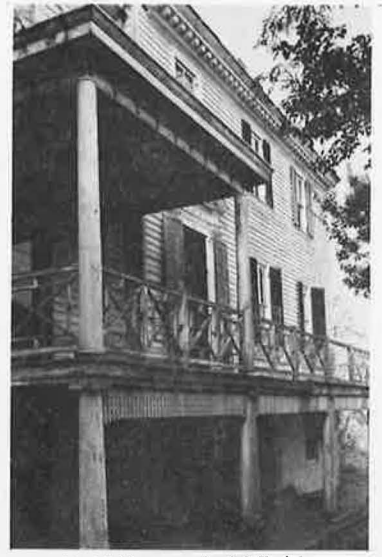
Todd House, Smithfield

YORKTOWN WRECKS ARCHAEOLOGICAL SITE, YORK COUNTY: This site includes the underwater remains of those British warships, transports, and assorted boats sunk off Yorktown during the siege of 1781.