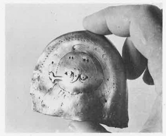
Copper tobacco can lid embossed with an owl smoking a mid-seventeenth century style pipe found at the bottom of a seventeenth century well on the Pettus' Plantation at Kingsmill.

a porch or shed to the west. Two additional post buildings, one with a <u>cellar</u>, were found to the west along with the brick-lined well, abandoned ca. 1690. The two outbuildings will be more fully explored in the spring.