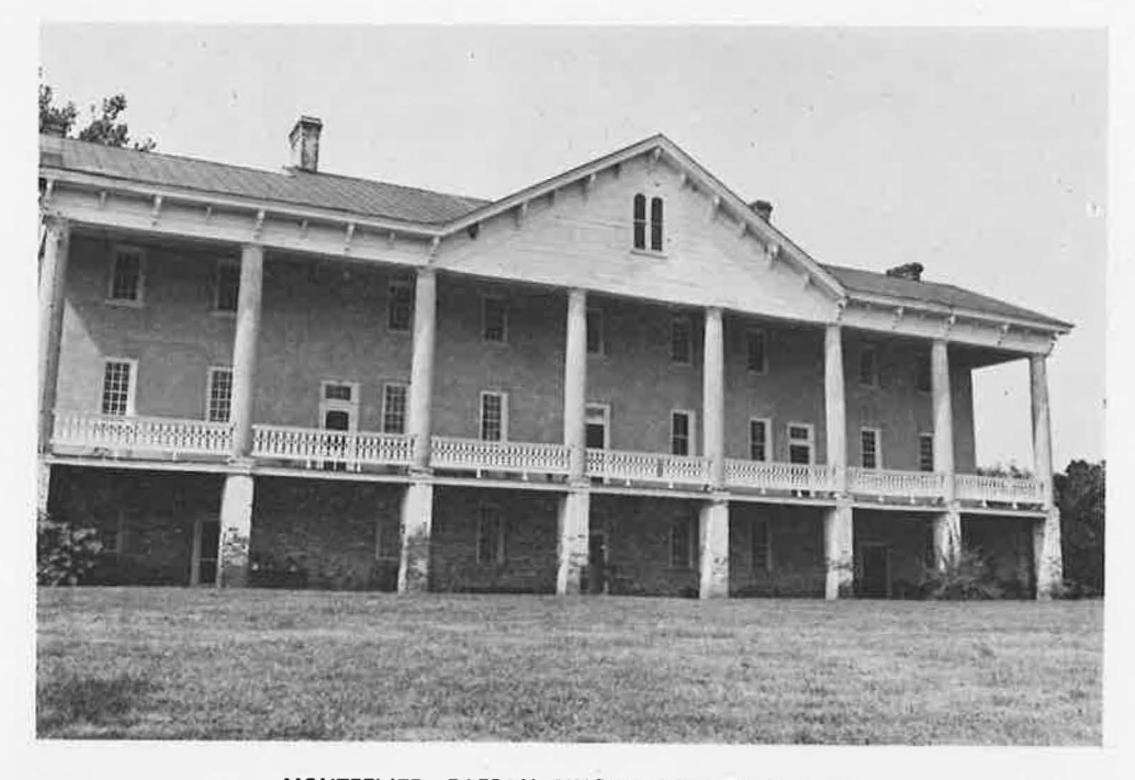
MONTPELIER, RAPPAHANNOCK COUNTY: Built for the County's premier land-developing family, the Thorntons, Montpelier commands a panoramic view of the F(rancis). T(hornton). Valley and the Blue Ridge. George Washington, a kinsman, frequently visited the plantation.

FORT PHILIP LONG, PAGE COUNTY: The fortified homestead, including tunnel-connected house, well, and vaulted fortification, are reminiscent of Page County's frontier period. The property is visually-dominated by a late-ante bellum house with noteworthy interior decoration.